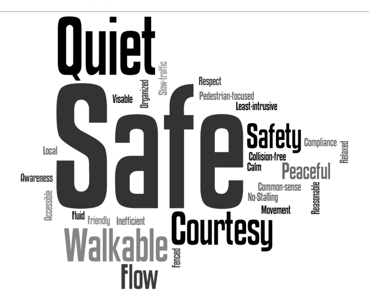
Figure Five: Workshop participant responses: What one word would you use to describe a liveable neighbourhood from a traffic perspective?

Online survey participants were asked, What word or phrase would you use to describe a livable neighbourhood from a traffic perspective?, allowing for greater description. Key ideas in the responses were similar to the one word responses; however, responses were split almost equally between those suggesting a "safe and quiet" neighbourhood to those promoting an "efficient and accessible" neighbourhood.