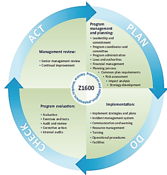
Figure 1 CSA Z1600 as structured in the "Plan-Do-Check-Act" (PDCA) continual improvement model (See Clause 0.1.)