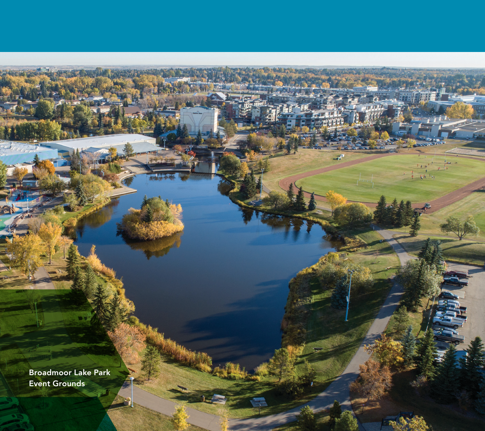
Broadmoor Lake Park Event Grounds

Strathcona County is home to over 98,000 residents and is nestled in the Edmonton Capital Region, within reach of three of Canada's premiere National Parks - Jasper, Banff, and Elk Island.